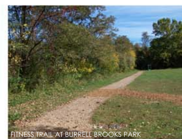
FITNESS TRAIL AT BURRELL BROOKS PARK