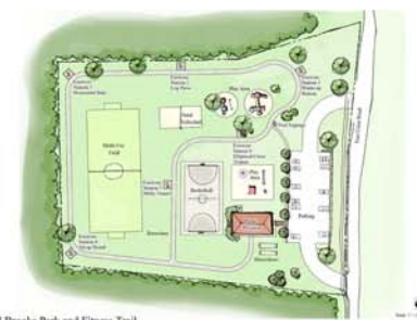
Burrell Brooks Park and Fitness Trail Harrison County, Virginia