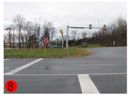
8 THE TRAIL WILL CROSS US 340 AT THE INTERSECTION WITH BROWNTOWN RD.