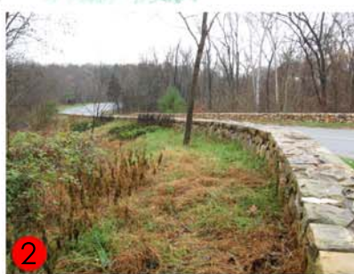
2 A PORTION OF THE TRAIL WILL RUN PARALLEL TO SKYLINE DRIVE