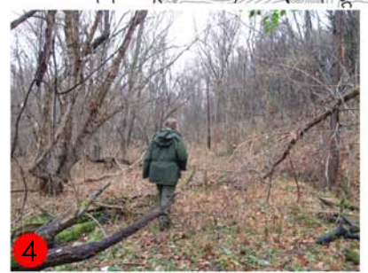
4 UTILIZING AN OLD ROAD BED FOR A PORTION OF THE TRAIL