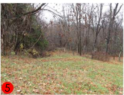
5 POTENTIAL NEIGHBORHOOD ACCESS POINT FOR THE TRAIL