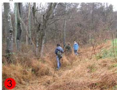
3 SECTION OF THE TRAIL THAT MAY REQUIRE BOARDWALK