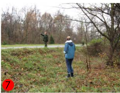
7 THE TRAIL WILL CROSS BROWNTOWN ROAD AS IT MOVES TOWARD SKYLINE HIGH SCHOOL