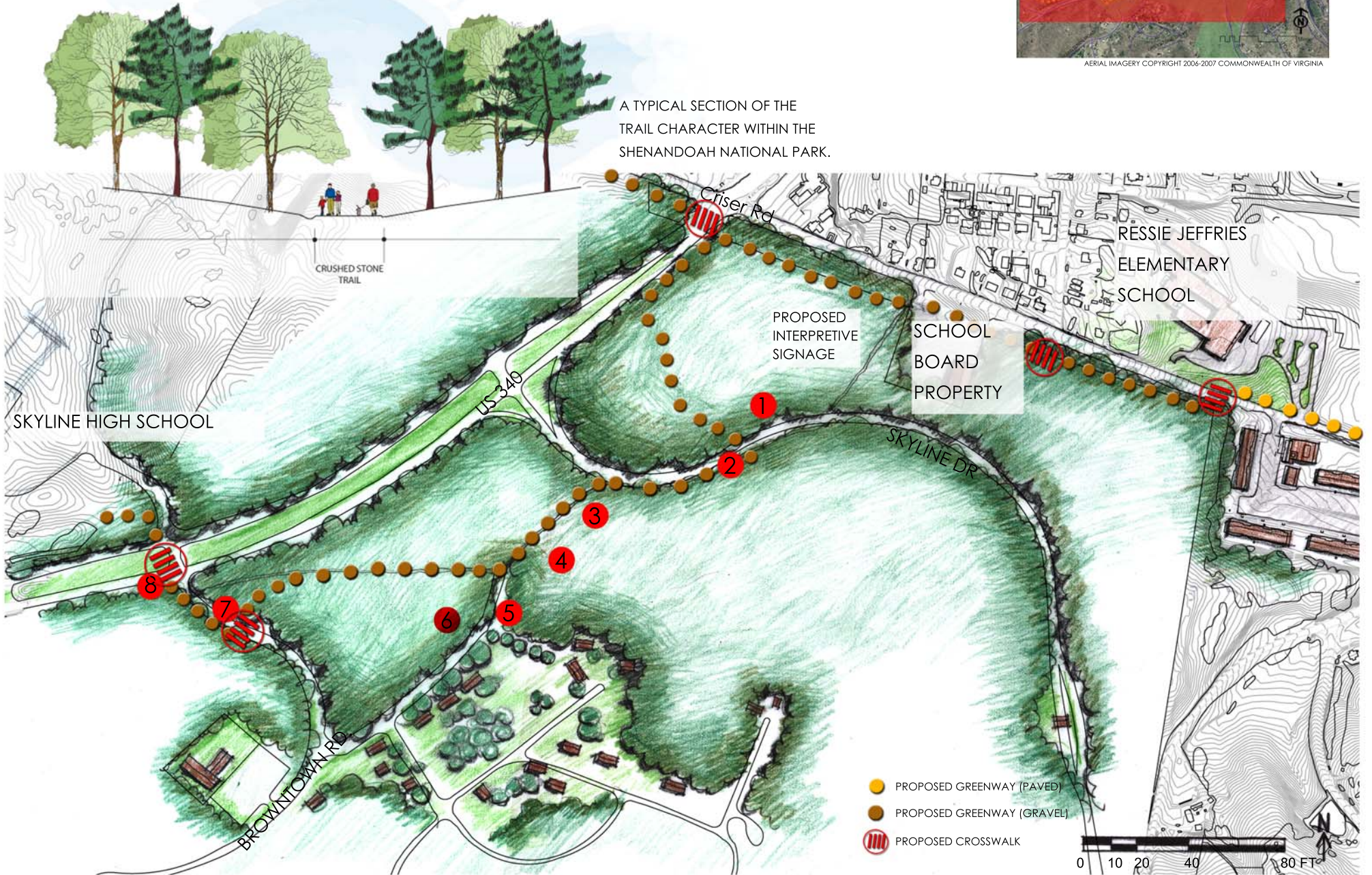
A TYPICAL SECTION OF THE TRAIL CHARACTER WITHIN THE SHENANDOAH NATIONAL PARK.