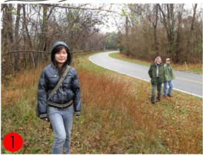
1 THE PROPOSED TRAIL WILL CROSS SKYLINE DRIVE