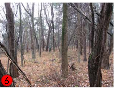
6 WOODED SECTION OF THE TRAIL WITH GENTLE SLOPES